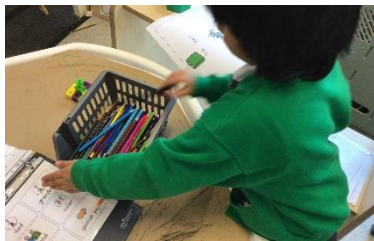
Taking pride in our classrooms, Keeping them neat and tidy