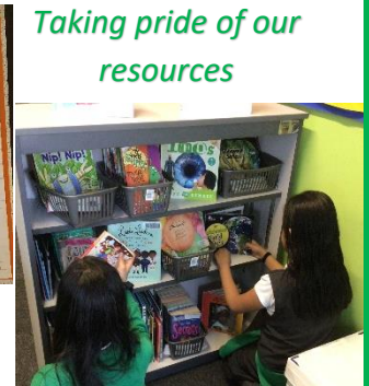
Taking pride of our resources

How do you show Pride outside of the Academy?